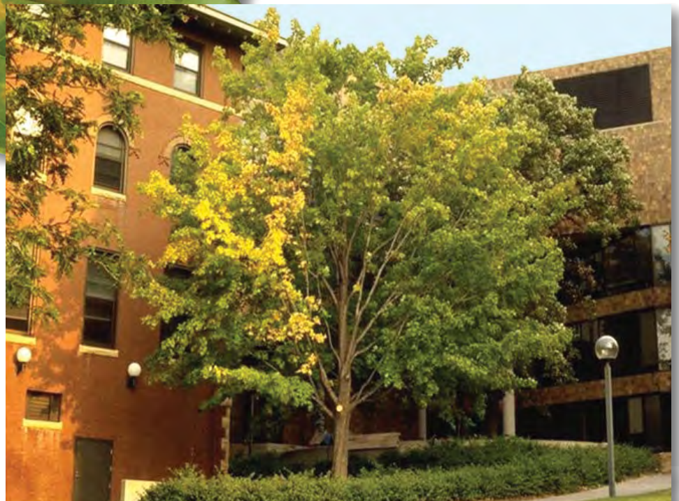
Fig 2. Mature maple showing branch death caused by acute Verticillium disease.

Affected plants or branches may wilt and die suddenly (acute disease) or may decline slowly over several years (chronic infection). Symptoms of acute infection include wilting of individual branches or groups of branches, leaf curling and drying, defoliation, abnormal yellow or red coloration between veins of leaves, and death of branches. Wilting may occur anytime during the growing season, but is most likely to appear in July and August. Cutting into the wood of wilted branches sometimes reveals dark discoloration under the bark. In cross section this discoloration may appear as rings following the growth rings of the plant. Color of the discoloration varies with the plant species affected. Discoloration in maples is light to dark green or black while that in catalpa is purplish pink to bluish brown. Ash trees generally show only faint, light tan discoloration. Acute symptoms indicate infection of the current season's water-conducting tissue, the sapwood. Plants may have acute symptoms in consecutive years or may skip one or more years, appearing normal or stunted in the interim. Younger trees showing acute symptoms usually die within one year.