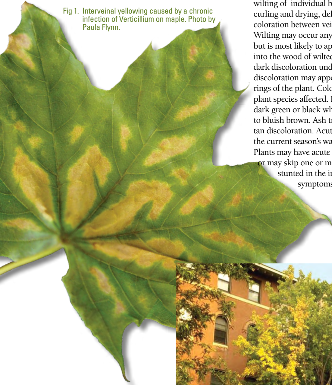
Fig 1. Interveinal yellowing caused by a chronic infection of Verticillium on maple.

Trees and shrubs are an integral part of our landscape. Verticillium wilt is a disease affecting a wide range of trees and woody shrubs, as well as herbaceous plants. In Iowa, it is especially common on maple, catalpa, ash, viburnum, lilac, and smoke tree. Planting resistant species and keeping plants in good vigor are the only ways to effectively manage this disease.