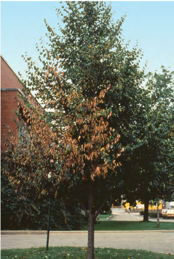
Fig 5. Linden tree showing symptoms of acute infection by Verticillium.