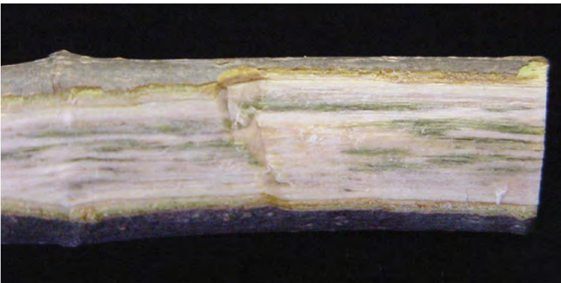
Fig 3. Vascular streaking in a maple branch infected with Verticillium .

The fungus survives in the soil as a thread-like body called a mycelium, or as small, resistant structures called microsclerotia. Microsclerotia may develop in infected plant tissues and may persist in the soil for 10 years.